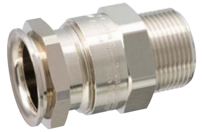
ADE 1F2 NPT