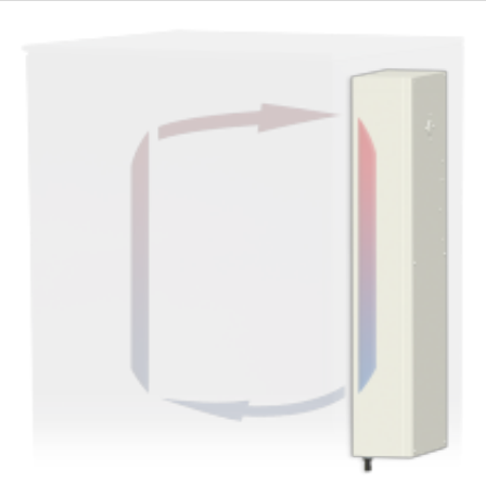
click image to enlarge