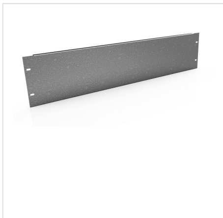
PUA płyta montażowa uniwersalna