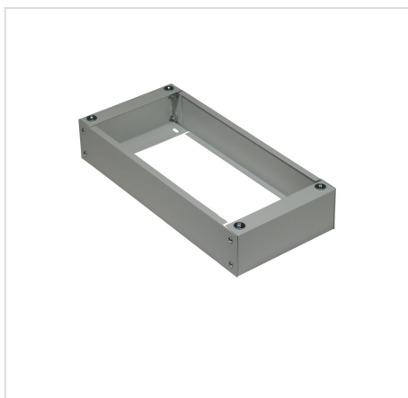
WIDOK COKOŁU DO RWX